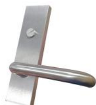
Art. SQ-03C-25-SCP External Square Plate with Emergency Turn & Lever