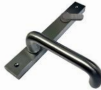
Art. NSQ-13VDA-25-SCP Internal Square Plate with DA Turn Snib & Lever