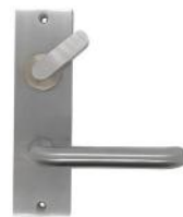
Art. SQ-13VDA-25-SCP Internal Square Plate with DA Turn Snib & Lever