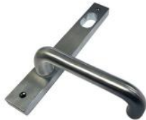
Art. NSQ-01V-25-SCP Internal Square Plate with Cylinder Hole & Lever