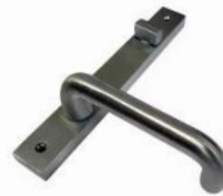
Art. NSQ-13V-25-SCP Internal Square Plate with Turn Snib & Lever