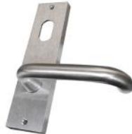
Art. SQ-01V-25-SCP Internal Square Plate with Cylinder Hole & Lever