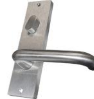
Art. SQ-13V-25-SCP Internal Square Plate with Turn Snib & Lever