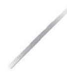
Art. SG-MLEXT-150SP EXTENDED Spindle suits all LOCKTON SG Mortice Locks