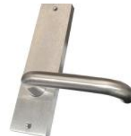
Art. SQ-02V-25-SCP Internal Square Plate with Lever Only