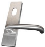
Art. SQ-01C-25-SCP External Square Plate with Cylinder Hole & Lever