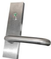
Art. SQ-53C-25-SCP External Square Plate with Emergency Turn Indicator & Lever