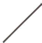
Art. SQ-M5-150FS EXTENDED furniture screw 'wide furniture' 150mm