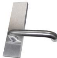
Art. SQ-02C-25-SCP External Square Plate with Lever Only