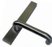
Art. NSQ-02C-25-SCP External Square Plate with Lever Only