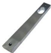
Art. NSQ-04V-SCP Internal Square Plate with Cylinder Hole Only