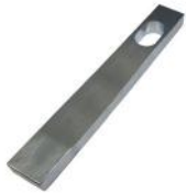
Art. NSQ-04C-SCP External Square Plate with Cylinder Hole Only