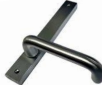
Art. NSQ-02V-25-SCP External Square Plate with Lever Only