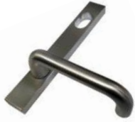
Art. NSQ-01C-25-SCP External Square Plate with Cylinder Hole & Lever